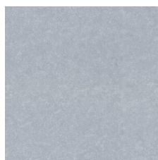
Concrete 19515 Weldrod 00515