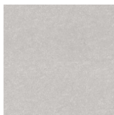
Natural 19110 Weldrod 00700