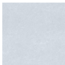
Dove 19104 Weldrod 00500