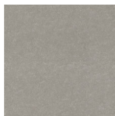
Flax 19114 Weldrod 00114