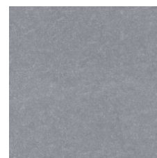
Mineral 19760 Weldrod 00550